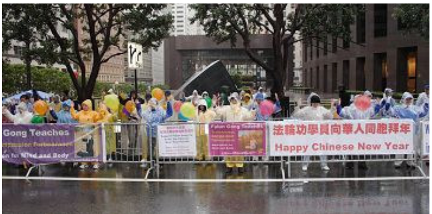
Falun Gong demonstration area during the San Francisco New Year Parade

(Clearwisdom.net) The San Francisco 2008 Chinese New Year Parade was held on February 23. Under the apparent influence of the Chinese Communist Party (CCP), the parade hosting organization – the Chinese Chamber of Commerce – once again barred Falun Gong practitioners from participating. The local police department, however, designated an area for the practitioners to display information which explained the facts about the persecution in China. Many parade spectators, after learning about the situation, expressed their support.